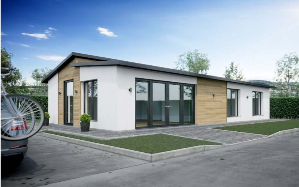
ARTIST IMPRESSION OF HOUSE BUILD TYPE.

Site for Holiday Home at Tully Bay Marina, 433 Lough Shore Road, Drumcrow East, Enniskillen, BT93 7FJ