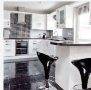
Interior photographs used for illustrative purposes only.