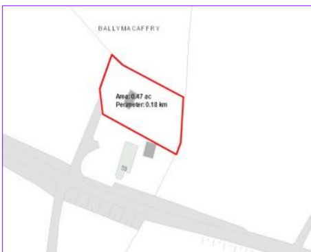
Aerial Site View

We are seeking offers in the region of £30,000 exclusive.