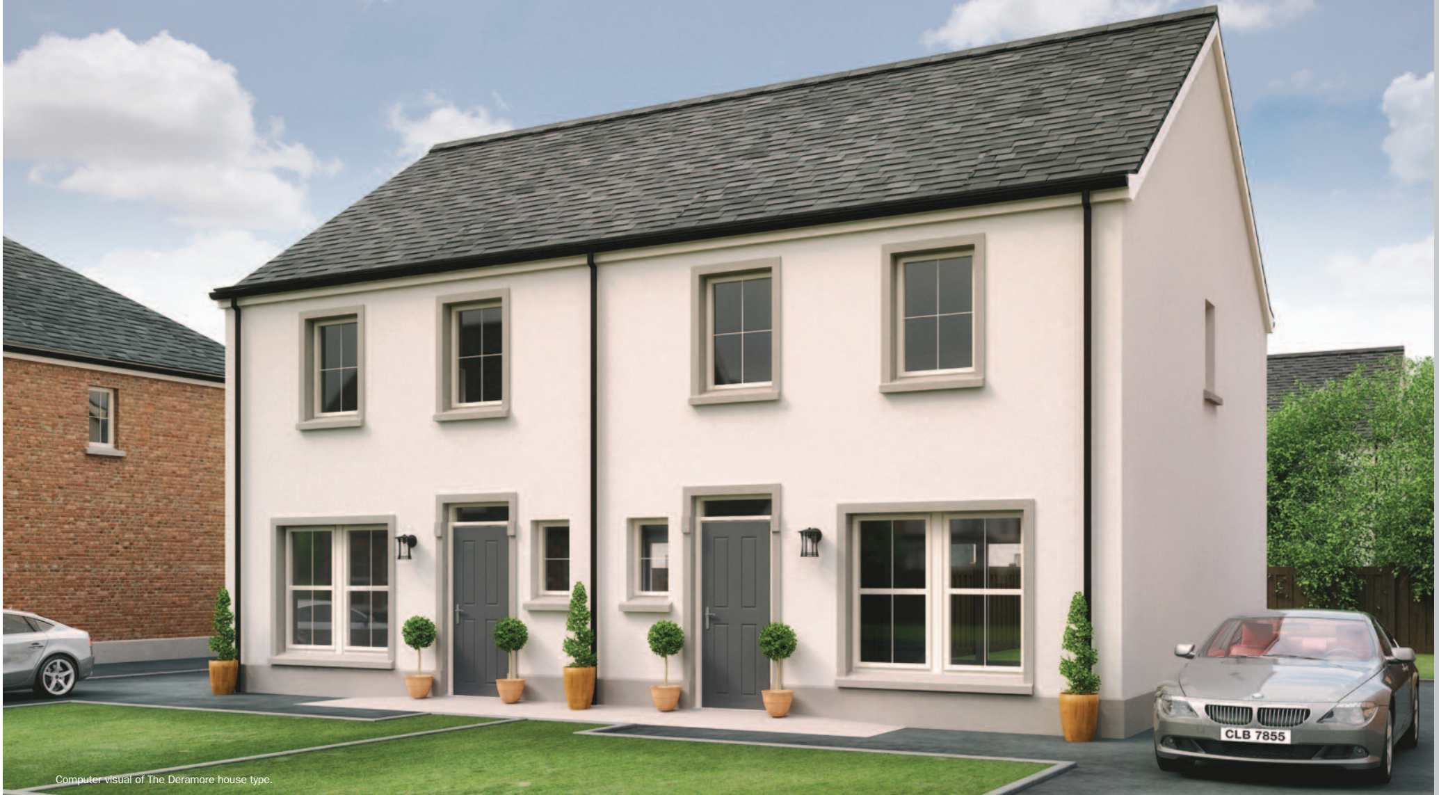
Computer visual of The Deramore house type.