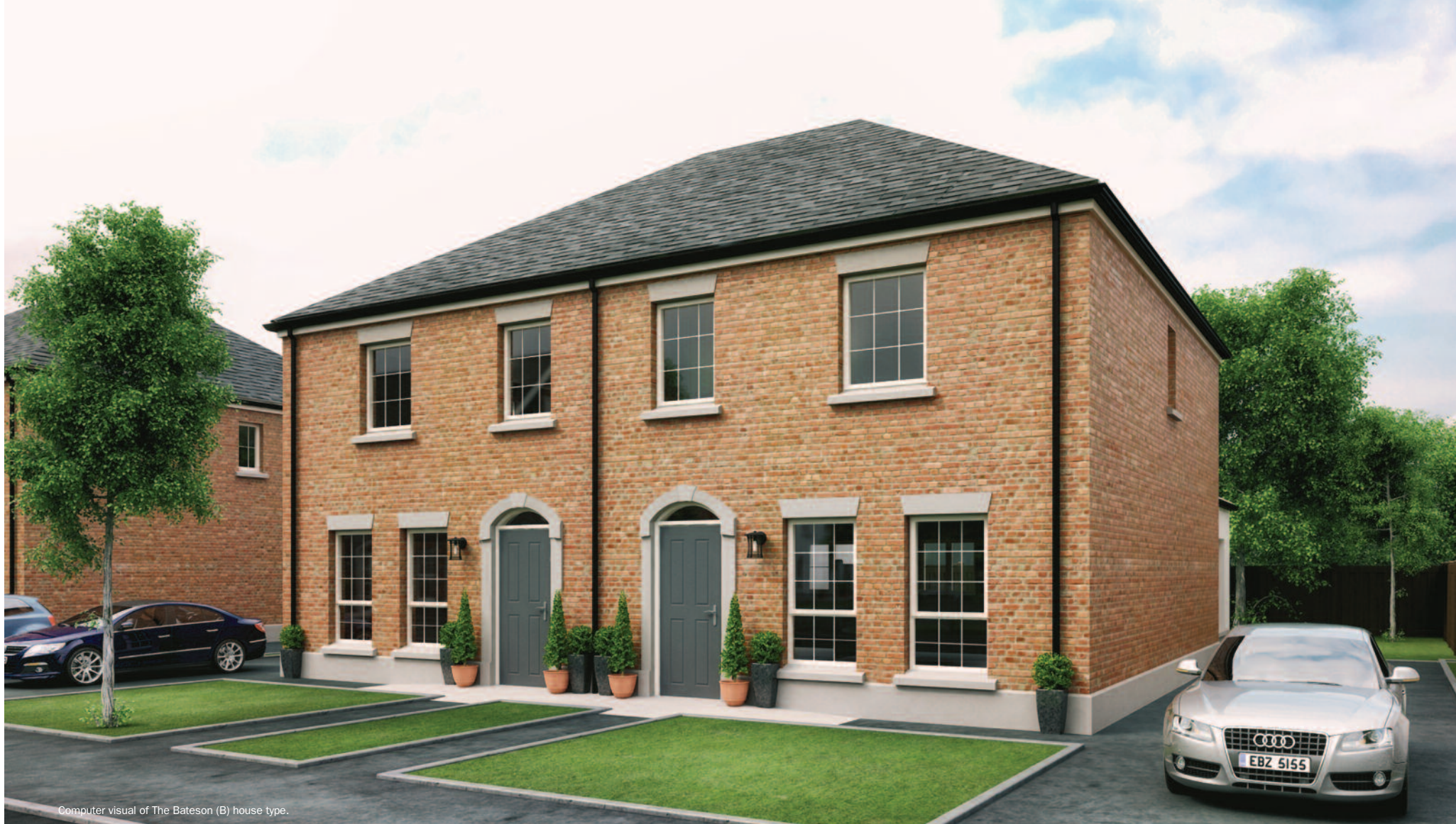
Computer visual of The Bateson (B) house type.